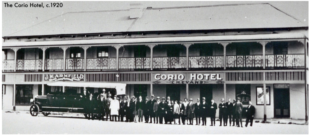
The Corio Hotel, c.1920