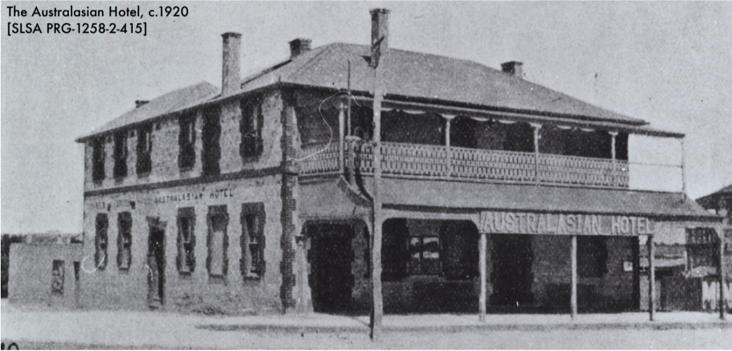
The Australasian Hotel, c.1920

Licensed in January 1858, the Australasian was converted into a private residence in 1983.