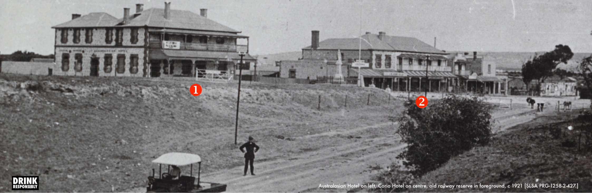
Australasian Hotel on left, Corio Hotel on centre, old railway reserve in foreground, c 1921