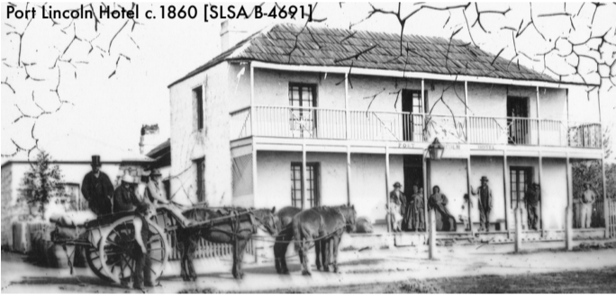
Port Lincoln Hotel c.1860

Established possibly as the Squatters' Arms then Bricklayers' Arms and licensed in 1840 as the Port Lincoln Hotel; relocated to its current site in 2008.