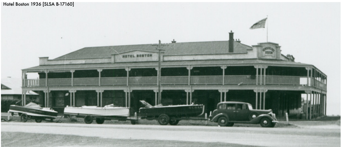
Hotel Boston 1936

The best preserved 'heritage' pub in Port Lincoln; built and licensed in 1929 "to cater for the ever-increasing number of pleasure-seekers that make Port Lincoln their playground each year."