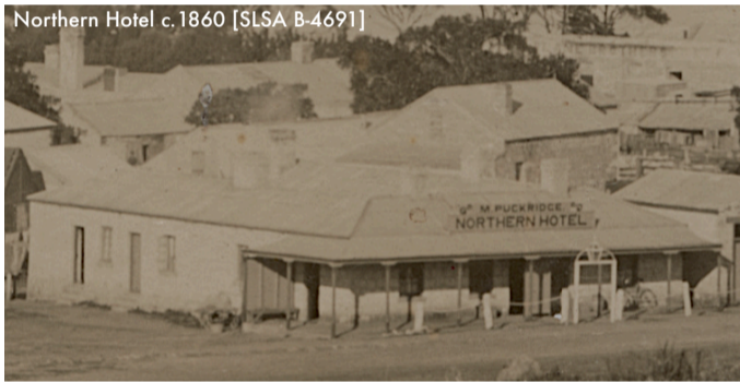
Northern Hotel c.1860

Licensed as the Northern Hotel from 1866 to 1926, then as the Great Northern.