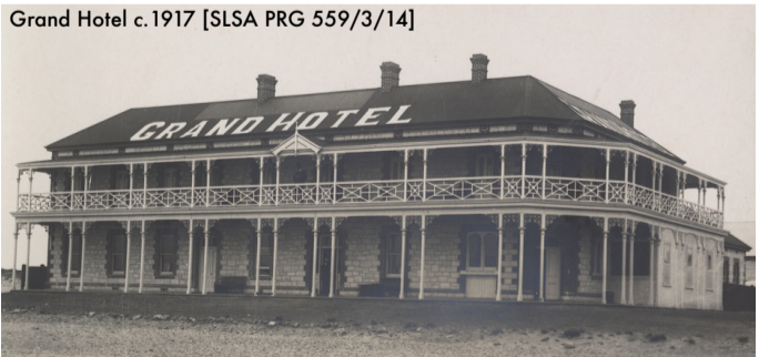
Grand Hotel c.1917 [SLSA PRG 559/3/14]

First licensed in 1906 and known variously as the Grand, Grand Port and Tasman.