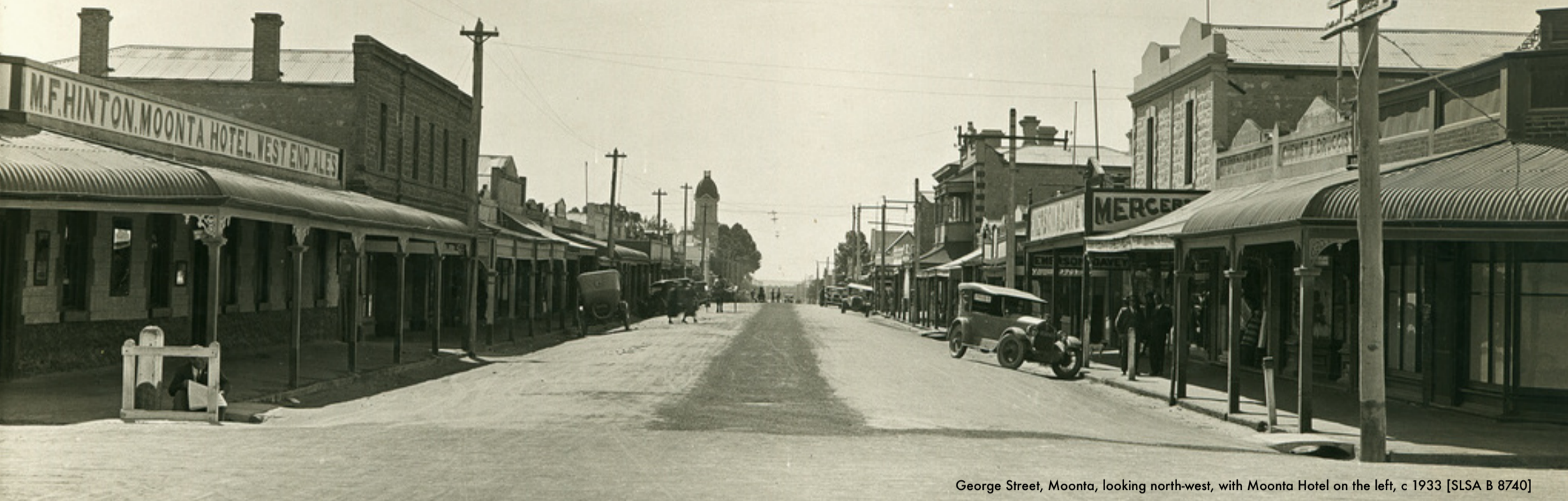
George Street, Moonta, looking north-west, with Moonta Hotel on the left, c 1933