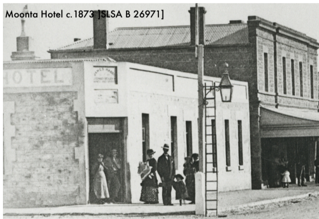
Moonta Hotel c.1873

Oldest hotel in Moonta, licensed 14 September 1863. In 1910 included nine bedrooms; patronised by farmers and miners. "A homely house, well conducted."