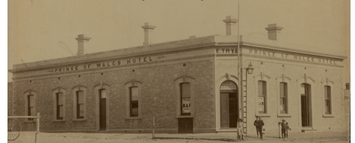
Prince of Wales Hotel c.1883

Also licensed 14 September 1863. Delicensed as a result of the Local Option poll in 1910, became "Moonta Temperance Hotel".