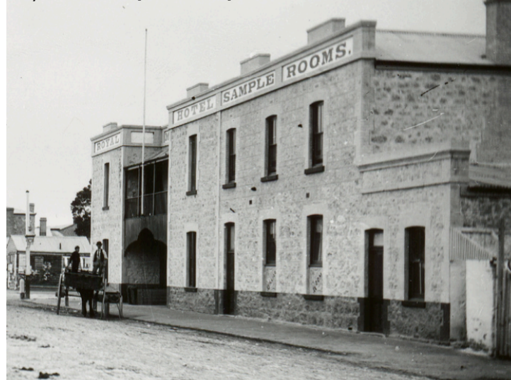
Royal Hotel c.1896 [SLSA B 21224]

First licensed in 1865. Closest pub to railway station. 'Sample rooms' added in 1896 for commercial travellers. Verandahs added in 1912.