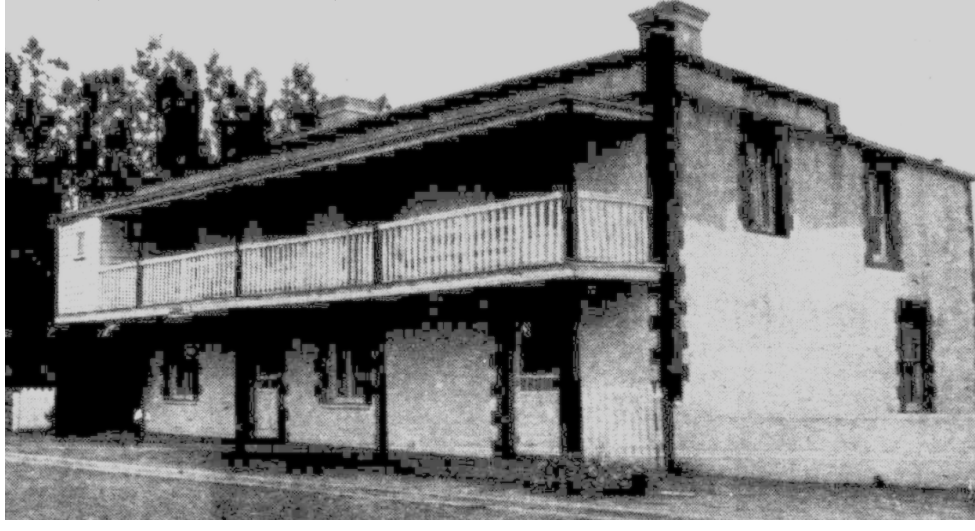
"Arnella", the former Port Elliot Hotel, c1975

The first stone building and the first pub in Port Elliot, the Port Elliot Hotel was licensed from June 1851 to December 1880 when its license was tranferred to the Royal Family Hotel.