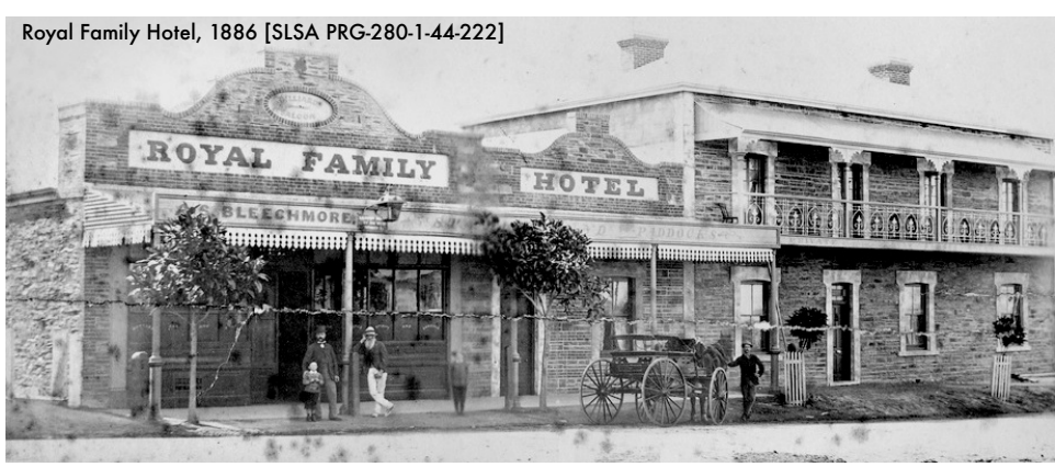
North Terrace and the Royal Family Hotel with Norfolk Pine at rear, c1889

Known as the "Royal" until 1894, the Royal Family Hotel has been licensed since December 1880. A second-storey was added to the western side (over what was originally Greayer's general store) in late 1928. The Norfolk Pine in the beer-garden was planted reputedly in about 1872.