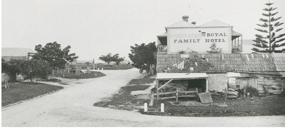
The information on this guide is mostly from "Bob" Hoad's Hotels and Publicans of South Australia and contemporary newspaper sources. Original content © Craig Hill, 2021. Downloadable from www.liquidhistory.com.au/Publications