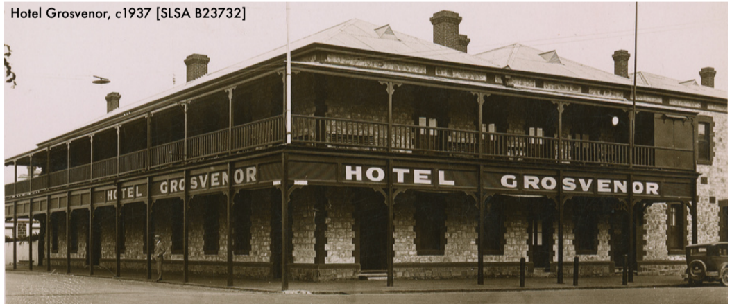
Hotel Grosvenor, c1937 [SLSA B23732]

"Replete with modern improvements for entertaining holiday makers" including gas lighting, a telephone, septic tanks and a motor car for guests [1908], the Grosvenor was built in 1896 and licensed the following year. The Governor holidayed at the Grosvenor in late 1900.