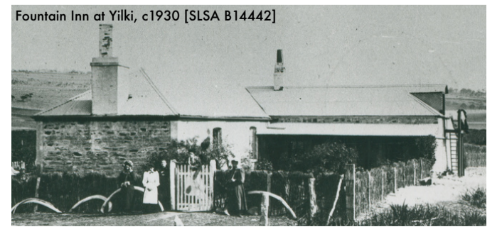
Fountain Inn at Yilki, c1930

Still standing at 66 Franklin Parade, Encounter Bay and almost certainly operating as the "Ship Inn" as early as 1839, the Fountain Inn was relicensed from 1847 to 1870.