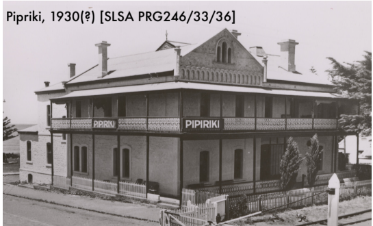
Pipiriki, 1930(?)

The Austral Hotel was built by English & Soward, and licensed from 1883 until 1916 when, refurbished, it became the Pipiriki Guest House.